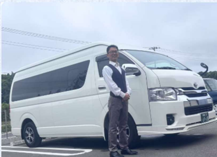
📍 Toyota Hiace (Exterior)