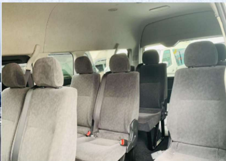
📍 Toyota Hiace (Interior1)